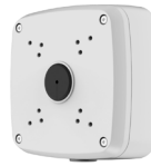
PFA121 Junction box