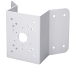
PFA151 Corner Mount